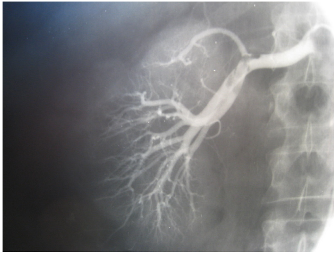
Fig. (5). Left selective renal arteriography showing multiple segmentary intrarenal emboli.