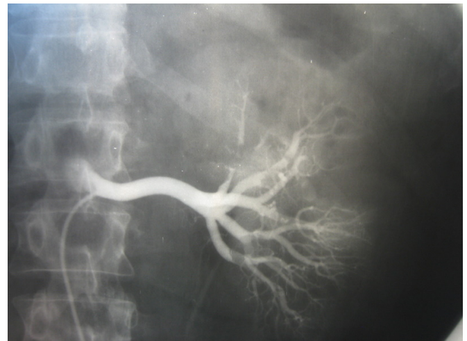
Fig. (3). Selective arteriography of a right renal artery showing partially emboli occlusion at bifurcation of the main renal artery.