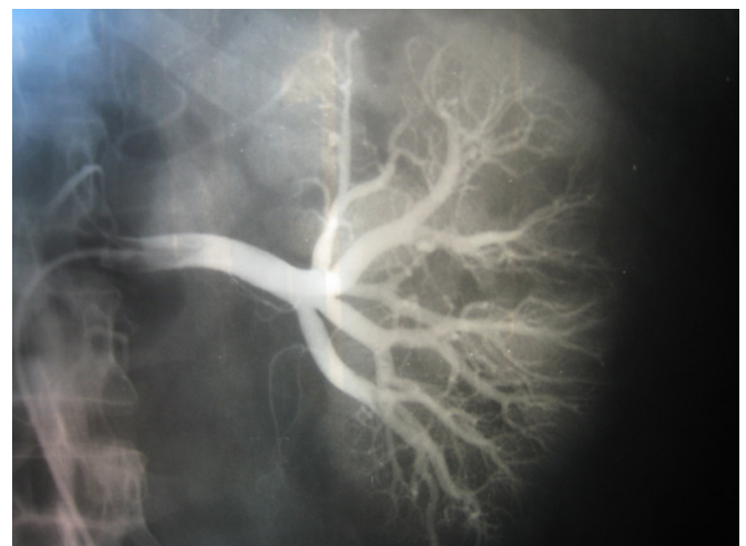
Fig. (4). Total emboli lysis after 24 hours of systemic fibrinolytic treatment.