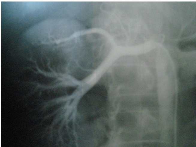
Fig. (6). Emboli lysis after fibrinolytic treatment with partial recuperation of perfusion of the parenchyma.

Ten of the 27 patients with embolism of the main renal artery (37.03%) versus 3/14 (21.4%) patients with intrarenal embolism required hemodialysis treatment during the acute phase ( P=.68 ). By treatment group, 8/13 (46.5%) patients in the surgical group, 2 /17 (13.3%) in the fibrinolytic group and 3/11 (27.3%) in the anticoagulation group required hemodialysis during the acute phase of embolism ( P=.12 ).