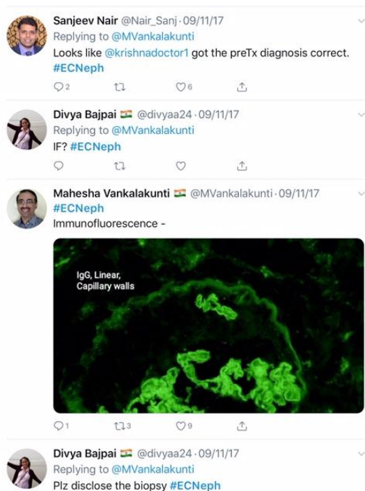
Fig. (2). Picture grab of an #ECNeph Twitter discussion

Here is an example of one such case that generated a heated discussion on Twitter, a case of Alport Disease with post-transplant graft dysfunction, and that case has been included in this series Fig. (2).