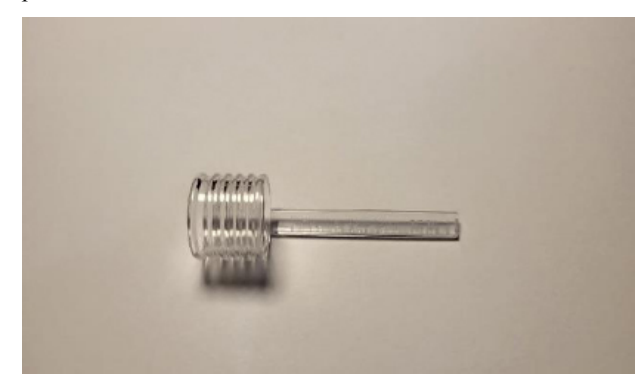
Fig. (1a). Circumplast<sup>®</sup> device.