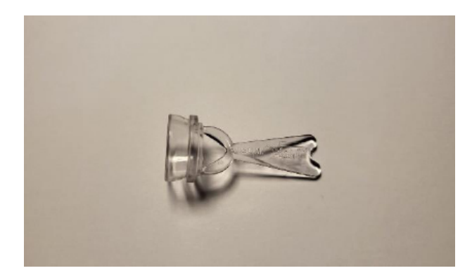
Fig. (1b). Plastibell<sup>®</sup> device.