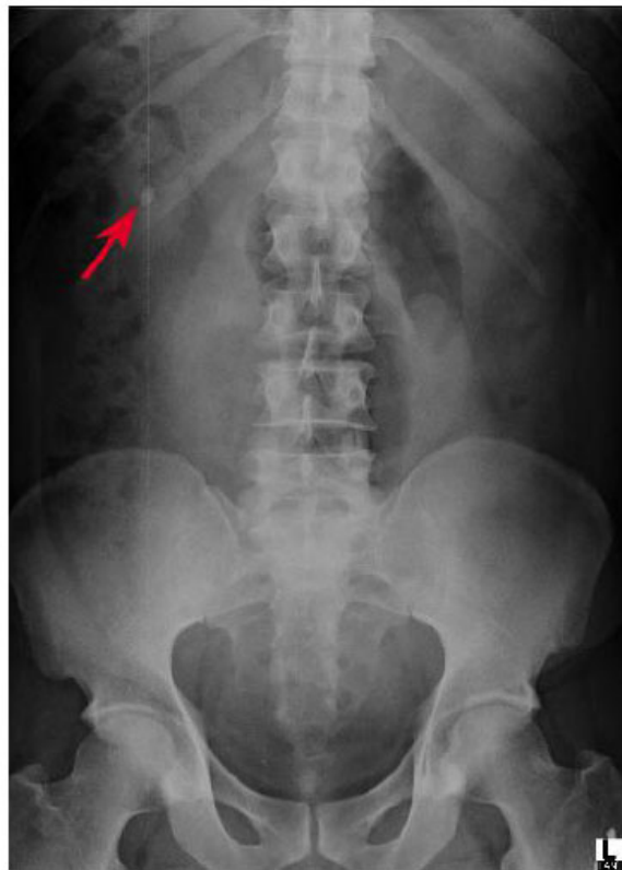
Fig. (1). Xray kidney ureter and bladder (KUB) showing a 1.5cm radiopaque shadow at the level of L 1 / L 2 vertebra in the area of right kidney.